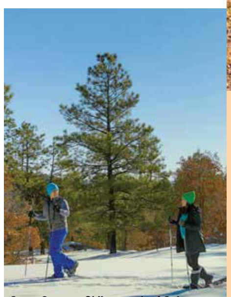
Cross Country Skiing north of Cuba

An easy 2½ mile cross-country loop trail starts near Redondo Campground in the Jemez, but cross-country aficionados will thrive in the challenging San Pedro Parks Wilderness or the open space at Valles Caldera. Telemark skiers can practice on the west side of Corral Canyon and Upper San Antonio Canyon. There are also open mountain trails on the east side of San Antonio Creek. www.newmexico.org/ski.